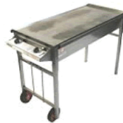
gas bbq 145.00