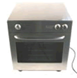
kitchen > convection oven 140.00