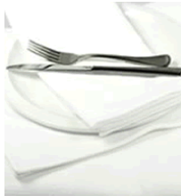
linen > napkin 1.90