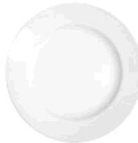
crocery > dinner plate (32cm) 1.30