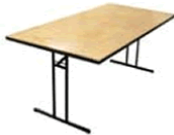
trestle table 24.00