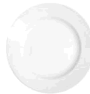
crocery > dinner plate (28cm) 1.20