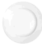
crocery > entree plate (22cm) 1.20