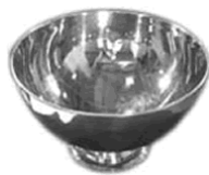
bar > ice tureen 16.00